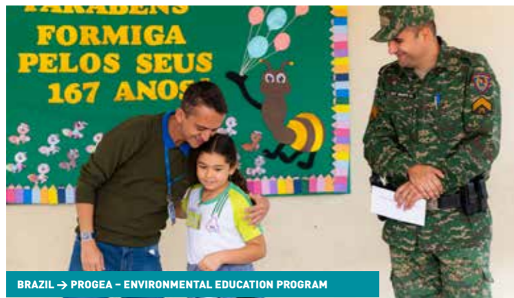
BRAZIL → PROGEA - ENVIRONMENTAL EDUCATION PROGRAM

Carmeuse continues to strengthen education in Ghana through engagement with schools in Sekondi-Takoradi and Bolgatanga (Ayuusi Yine Junior High). During our visits, we met with school teams to discuss sustainability, academic priorities, and future ambitions. At Ayuusi Yine Junior High School, a new staff room—funded through the Triathlime fundraising initiative—now offers teachers a dedicated and improved workspace.