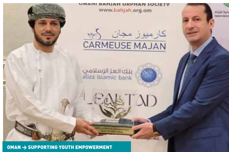
OMAN → SUPPORTING YOUTH EMPOWERMENT

Ten scholarships supported more than 220 youth athletes, strengthening physical activity and healthy lifestyles, through the 'Mas Deporte CBB' program, in Antofagasta, Teno, and Talcahuano. The program has been active since 2021.