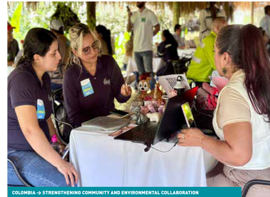
COLOMBIA → STRENGTHENING COMMUNITY AND ENVIRONMENTAL COLLABORATION