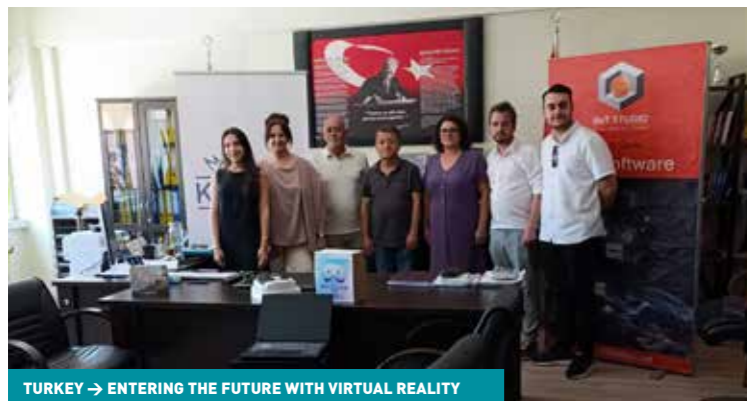
TURKEY → ENTERING THE FUTURE WITH VIRTUAL REALITY

We donated a virtual reality mining system and provided related training at Soma Vocational High School, benefiting 716 students, six teachers and five employees.