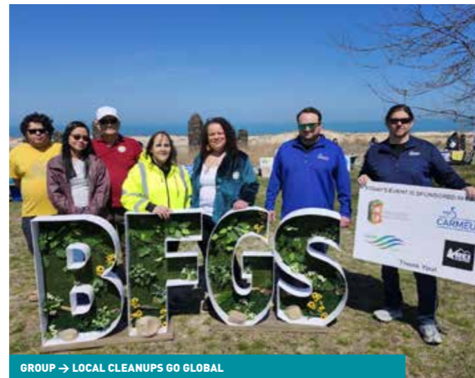
GROUP → LOCAL CLEANUPS GO GLOBAL