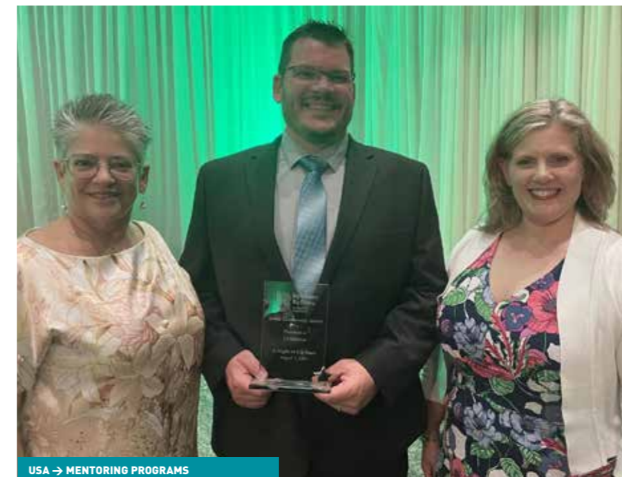
USA → MENTORING PROGRAMS

Carmeuse Longview received the Community Award from Big Brothers Big Sisters of Shelby County, recognizing our sustained support for a school-based