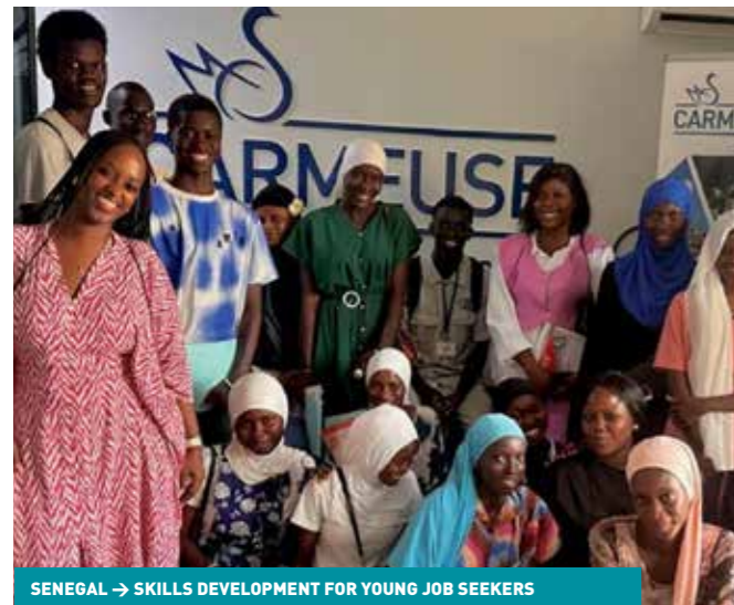
SENEGAL → SKILLS DEVELOPMENT FOR YOUNG JOB SEEKERS