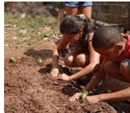
BRAZIL → URBAN GARDEN PROJECT