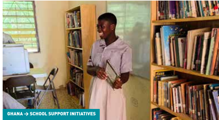
GHANA → SCHOOL SUPPORT INITIATIVES

mentoring program pairing high school mentors with elementary and middle school students, as well as five years of Advisory Board leadership.