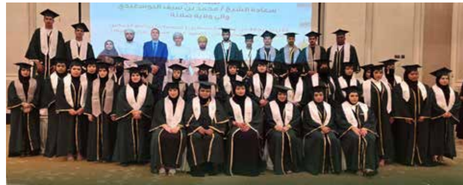
OMAN → CARMEUSE MAJAN SIGNED COOPERATIVE AGREEMENTS WITH SMALL AND MEDIUM-SIZED ENTERPRISES

Through partnerships with foundations and municipalities, CBB advances local infrastructure by covering socialization, project management, and engineering costs and preparing projects for public funding, tendering, and execution. Projects across four municipalities include two completed (Paseo Comalle pavement in Teno and speed bumps in Talcahuano), two in progress for 2026 delivery (LED lighting for an avenue in Arica and participatory pavement works on three streets in Talcahuano), and three in the design or application stage (improvements to the Hand of the Desert area in Antofagasta, Phase II of the Paseo Comalle pavement in Teno, and a family recreation area in Talcahuano).